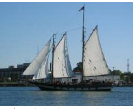
See majestic schooners up close during Schooner Rendezvous.

Experience the beauty and majesty of schooners and other historic ships during the Cambridge Schooner Rendezvous Oct. 23-25 at Long Wharf in Cambridge. Stop by for dockside tours, sails, and mariner's tours, as well as maritime and bluegrass music, food, vendors, and more. Opening festivities include a Parade of Sail 11am-1pm on Saturday. And be sure to stop by at night—for the first time, the boats will be illuminated until 11pm Friday and Saturday nights (thanks to the Choptank Electric Cooperative).