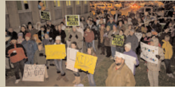
Liquor license rally Nov. 18.

The Liquor Board will vote on these proposals Dec. 1. Then the Dorchester County Council