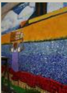
CANNERY WAY MURAL