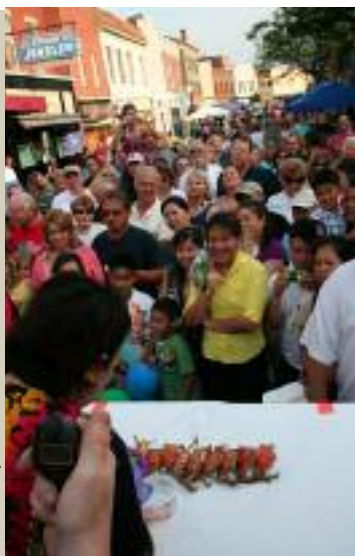
The crowd gathers to watch the crab-picking contest during the Taste of Cambridge.

The 2009 Taste of Cambridge brought bigger crowds and raised more money than anyone expected. During the July 11 event, a record 12 Dorchester County restaurants prepared 18 crab dishes (plus one oyster dish). There were some very close calls in the Crab Cook-Off competition. The full listing of winners is at right.