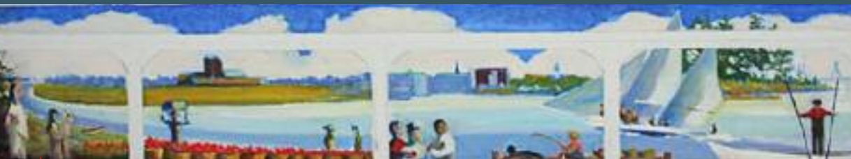
▲ A mock-up of the mural planned for the side of the Hunt Insurance building on Race Street.