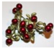
BROOCH AT JOIE DE VIVRE

Jewelry. Who can resist jewelry? In downtown Cambridge, you'll find a wide range of styles and prices for every budget. Try Lednum's Jewelers for fine jewelry; handcrafted pieces at Joie de Vivre, LunaChick, Pear Tree South, and Sunnyside; and the latest trends at Dragonfly.