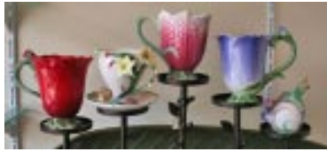
FUN TEACUPS AT A FEW OF MY FAVORITE THINGS

Looking for some great Mother's Day ideas? Try a few of these right here in downtown Cambridge!