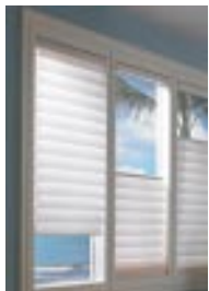
HUNTER DOUGLAS BLINDS

Give a house lift: How about a gift certificate toward new window treatments or blinds? You'll find them at JFH Designs and Hubbard's Blinds & Custom Framing. Or browse antique shops together—try Backfin, Chesapeake Classics, and Trumpeter Swan.