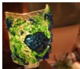
NIGHT LIGHT AT DRAGONFLY

Great gifts. Wander through the downtown shops and you'll see lots other interesting gift possibilities, such as these night-lights made from recycled glass at Dragonfly and a collection of colorful wallets and bags at Sunnyside.