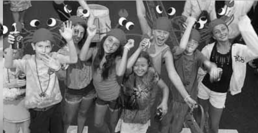
Kids in crab hats.

Thanks to the hundreds and hundreds of crab lovers, visitors, volunteers, restaurants, vendors, and others who came out despite the soggy weather to make a terrific Taste of Cambridge on July 10!