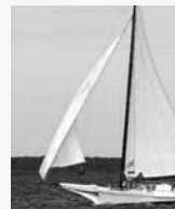
Skipjack Nathan of Dorchester

Meet at Long Wharf at the end of High Street. $8 for adults; 12 and under free. Reserve at 410.901.1000. Or join a skipjack cruise on the Nathan of Dorchester . Cruises are usually 1-3pm on Saturdays, and sometimes on Sundays. Check schedule and reserve at www.skipjack-nathan.org. Perfect for out-of-town guests, new residents, and even long-time locals!