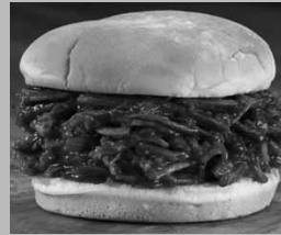
Come for the BBQ!

The event features the wacky and fun Main Street Mile, where teams from local businesses and organizations do a relay race on tricycles, wearing snorkel flippers, etc. For more information on Summer Send-off and the Main Street Mile, go to www.cambridgemainstreet.com and click on "Summer Send-Off."