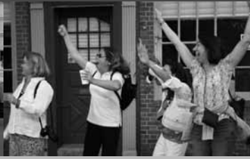
Come for the cheers!