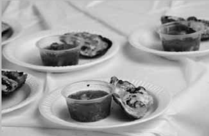
Oyster crabafeller by Ocean Odyssey.