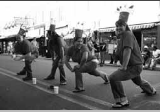
Come for the costumes!