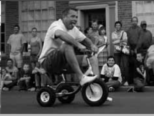
Come for the trikes!